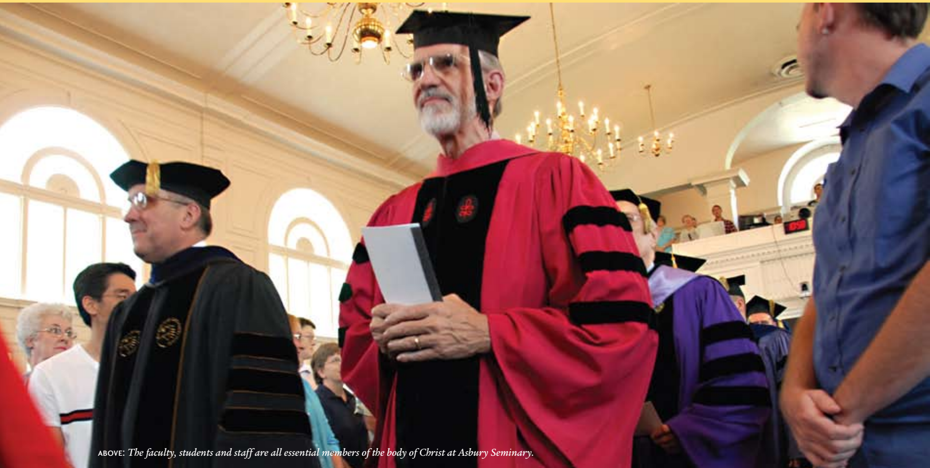
ABOVE: The faculty, students and staff are all essential members of the body of Christ at Asbury Seminary.