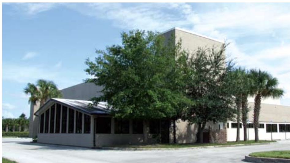
ABOVE: The Florida campus

The Asbury Florida campus exists to honor and manifest these historic purposes, and we do it in every way we know how. But the