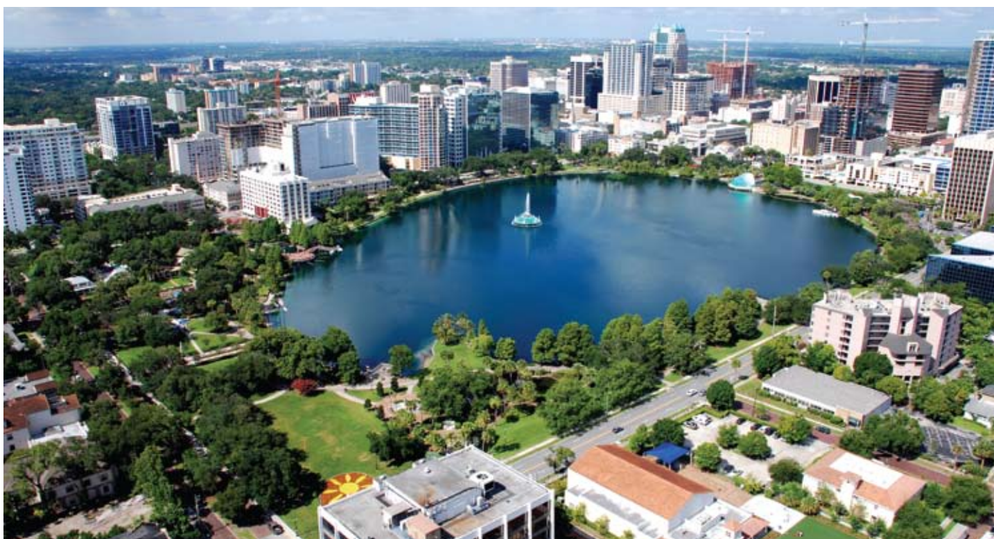
ABOVE: Orlando.

21st century is being called the century of “Globalization.” We are located and poised to harvest much fruit from that tree of opportunity.