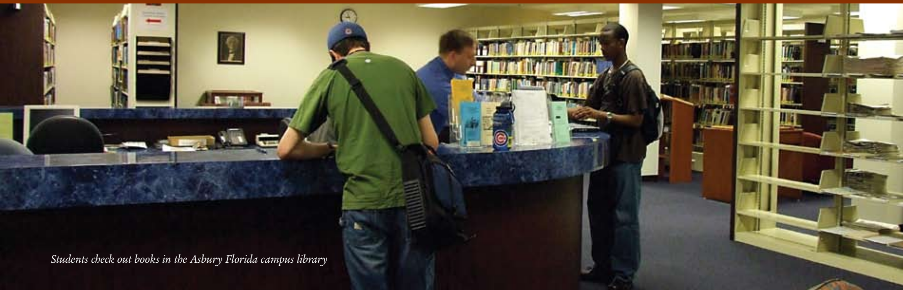
Students check out books in the Asbury Florida campus library