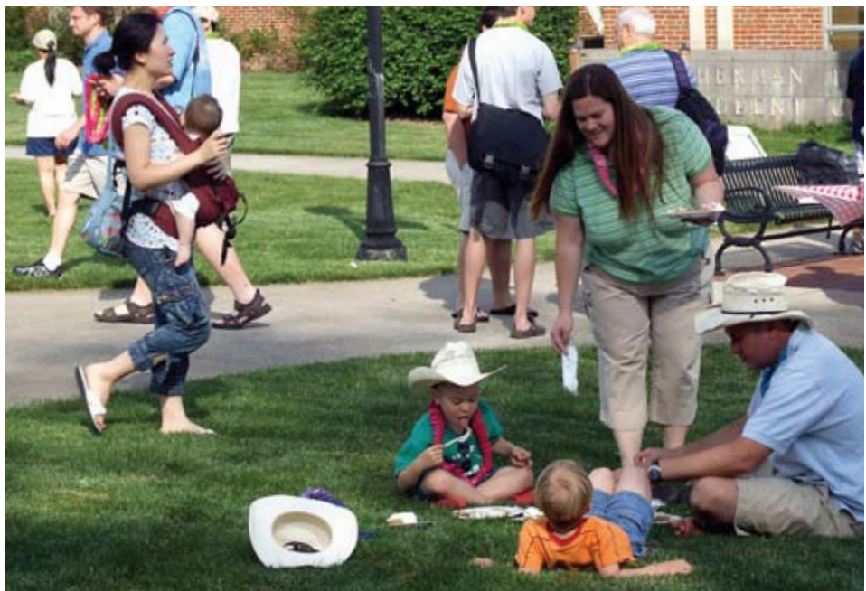
ABOVE: Kentucky students and families enjoy a picnic on the green.