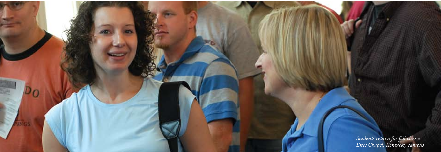
Students return for fall classes. Estes Chapel, Kentucky campus